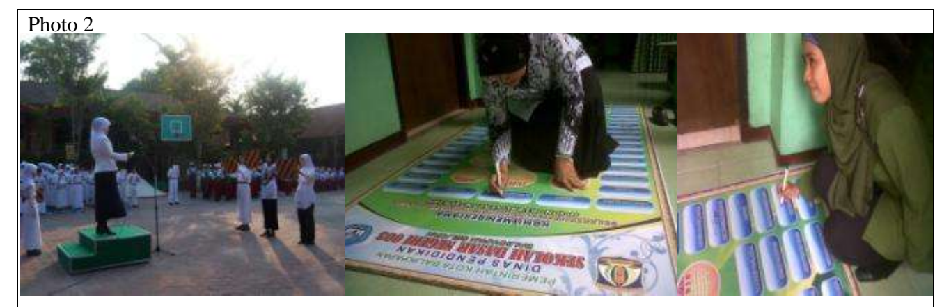
(Flag Ceremony of declaration about the program involving all teachers, staffs, and students. After that, the signing of board commitment about the implementation of moral and character values education in SD Negeri 003 Balikpapan Selatan)