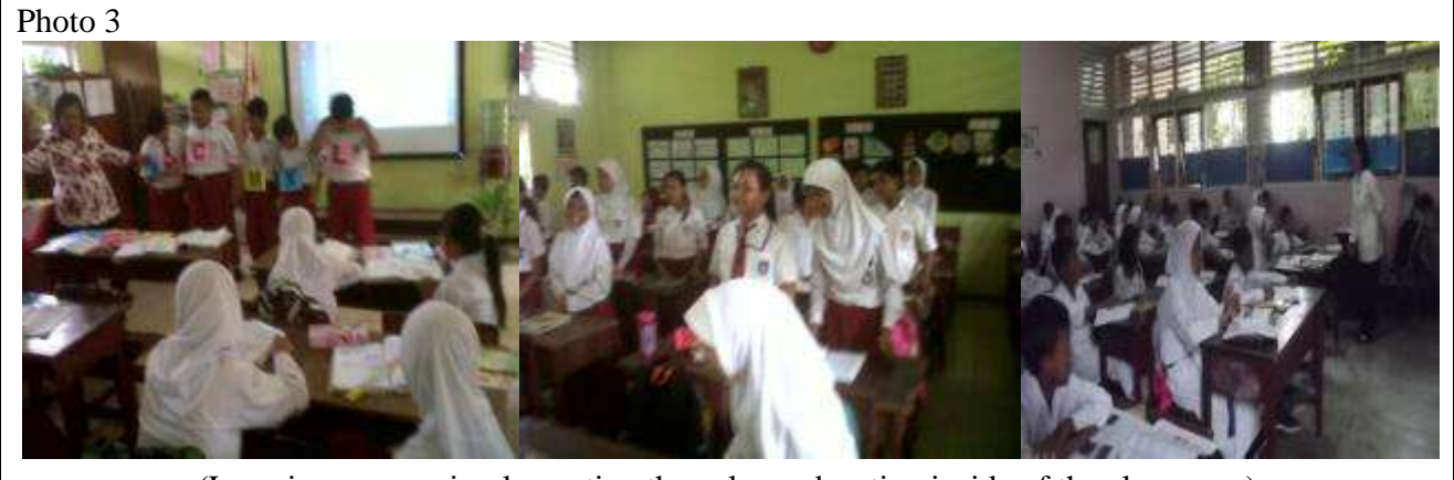
(Learning process implementing the values education inside of the classroom)