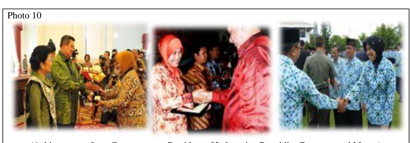
(Achievements from Government – President of Indonesian Republic, Governor and Mayor)