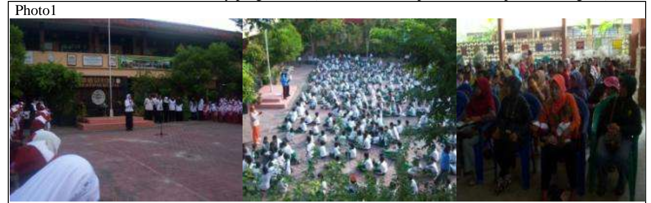
(Socialization about the school program to the parents, society, and especially to the students continuously according to the schedule)

17. Photos related to the activity/programme (Maximum of 10 photos with captions in English)