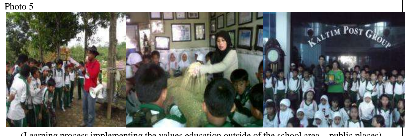
(Learning process implementing the values education outside of the school area – public places)